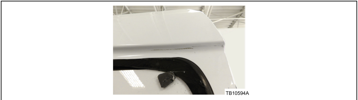
Figure 3 - Article 15-0085