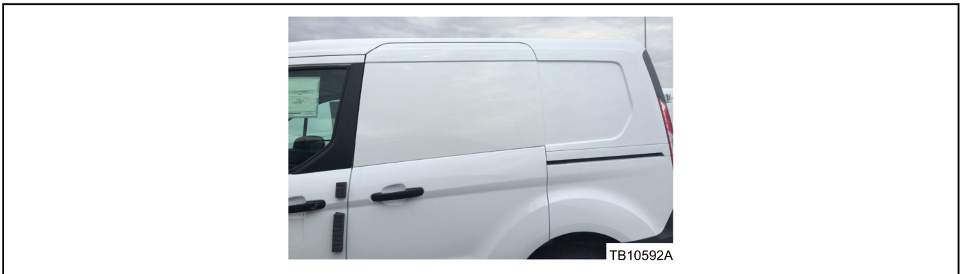
Figure 1 - Article 15-0085